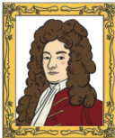
Sir Christopher Wren