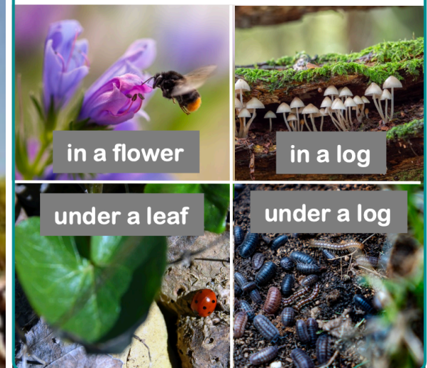
in a flower