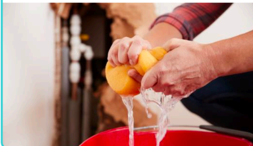
Objects which absorb water