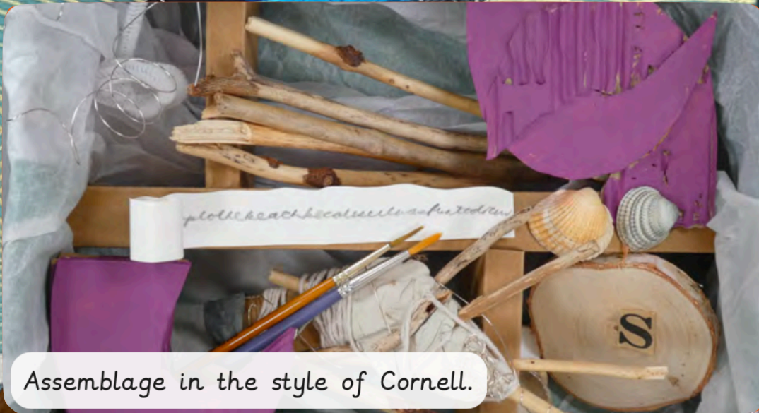
Assemblage in the style of Cornell.

Cornell made 3D art from found objects with personal meaning assembled in a box. He was one of the first artists to create 'Assemblage' art.