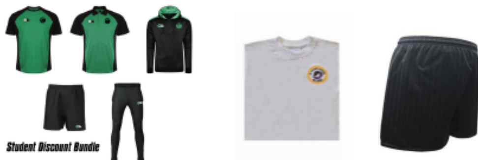
Student Discount Bundle

PE Kit can be purchased online on the following website: https://www.truesportingcolours.com/pupils-574-c.asp .